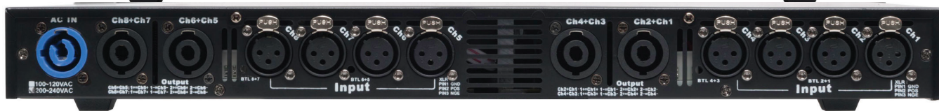
Digital switch mode Amp: MIKRO 8 8in-8out Output(8Ω): 8x200W OUTPUT(4Ω): 8x300W