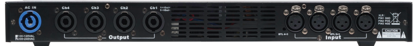
Digital switch mode Amp: MIKRO 4 4in-4out Output(8Ω): 4x200W OUTPUT(4Ω): 4x300W