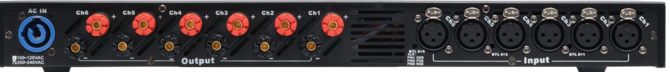
Digital switch mode Amp: MIKRO 6 6in-6out Output(8Ω): 6x200W OUTPUT(4Ω): 6x300W