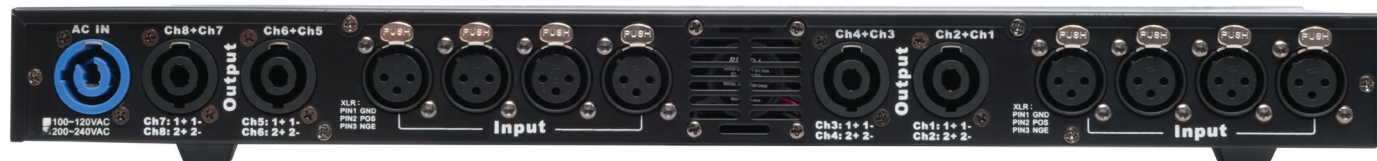
Digital switch mode Amp : Mikro 708 8in-8out Output(8Ω) : 8x70W OUTPUT(4Ω) : 8x130W