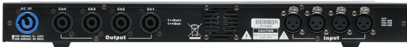
Digital switch mode Amp : MIKRO 704 4in-4out Output(8Ω) : 4x70W OUTPUT(4Ω) : 4x130W